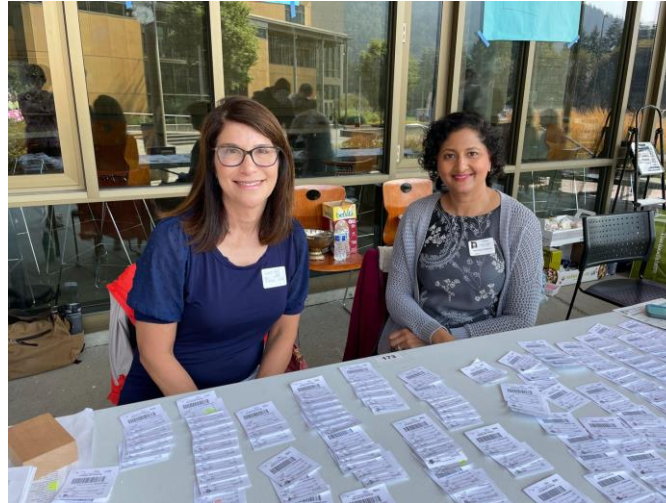
Picture Day/Laptop Checkout/Textbook Day