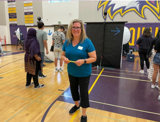
Picture Day/Laptop Checkout/Textbook Day